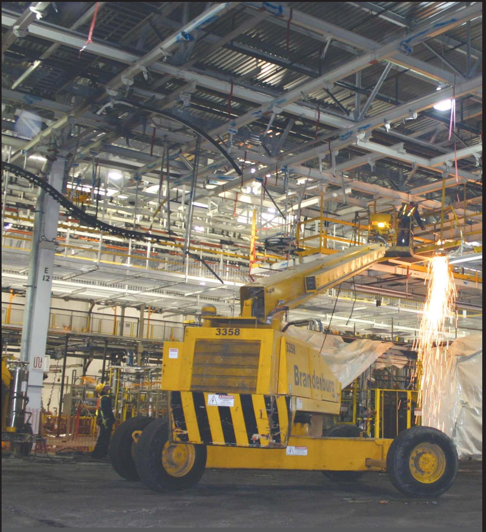
FORD BODY SHOP CHICAGO, ILLINOIS